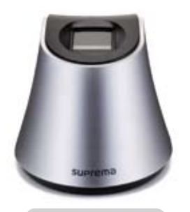
BioMini Front View