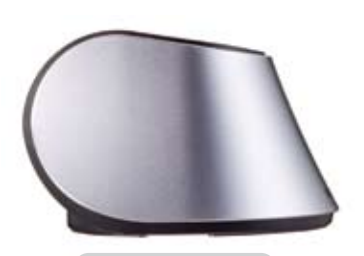
BioMini Side View